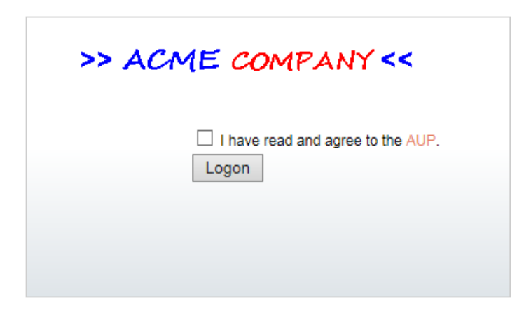
Captive Portal Page

When a user first logs on to a network with a captive portal, a Web page is presented that requires certain actions before Internet access is granted. A simple captive portal forces the user to at least look at, if not read, an Acceptable Use Policy (AUP) page, and then click or tap a button indicating agreement to the terms of the policy. The captive portal page is customizable, which allows for organizations to add their company logo and own message or policy text to the logon page.